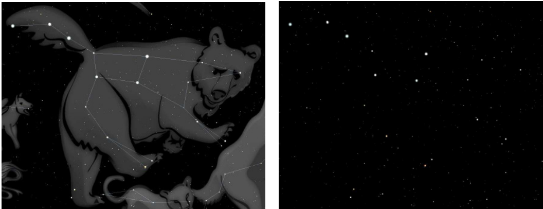
Fig. 2: The constellation of Ursa Major.

Constellations are patterns of stars that human eyes join to form figures often drawn from mythology. Constellations provide a mnemonic aid to the search of an object in the sky. This is a subjective process and stars in a constellation are not really connected in any physical way. In fact, different cultures have grouped stars into different constellations.